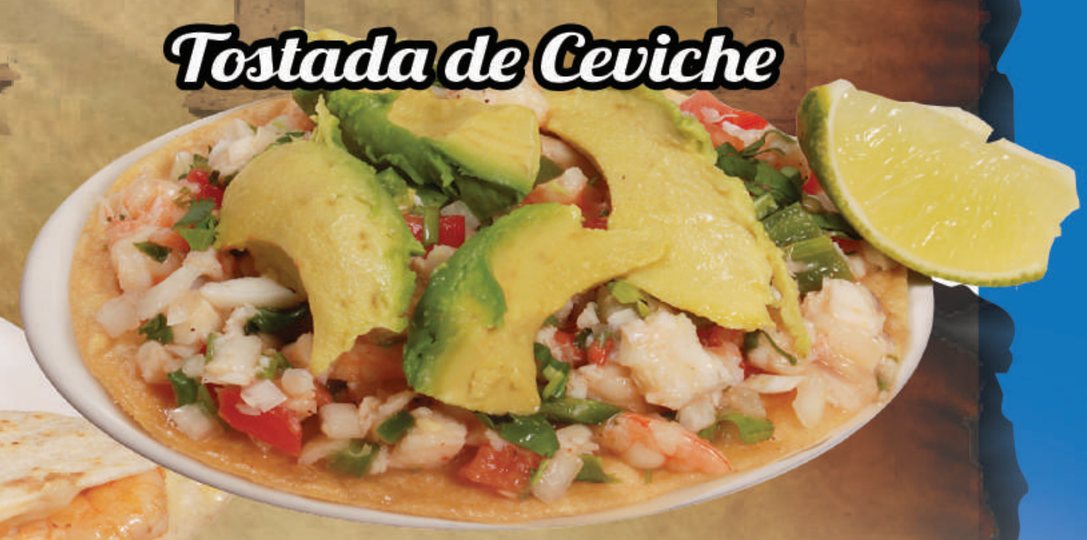
Tostada de Ceviche