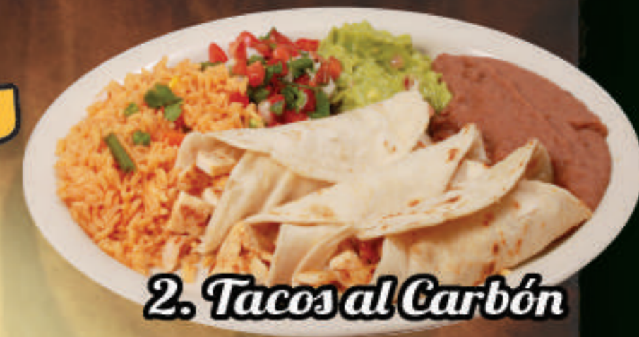
2. Tacos al Carbón

Fried Flour Tortilla with Choice of Meat