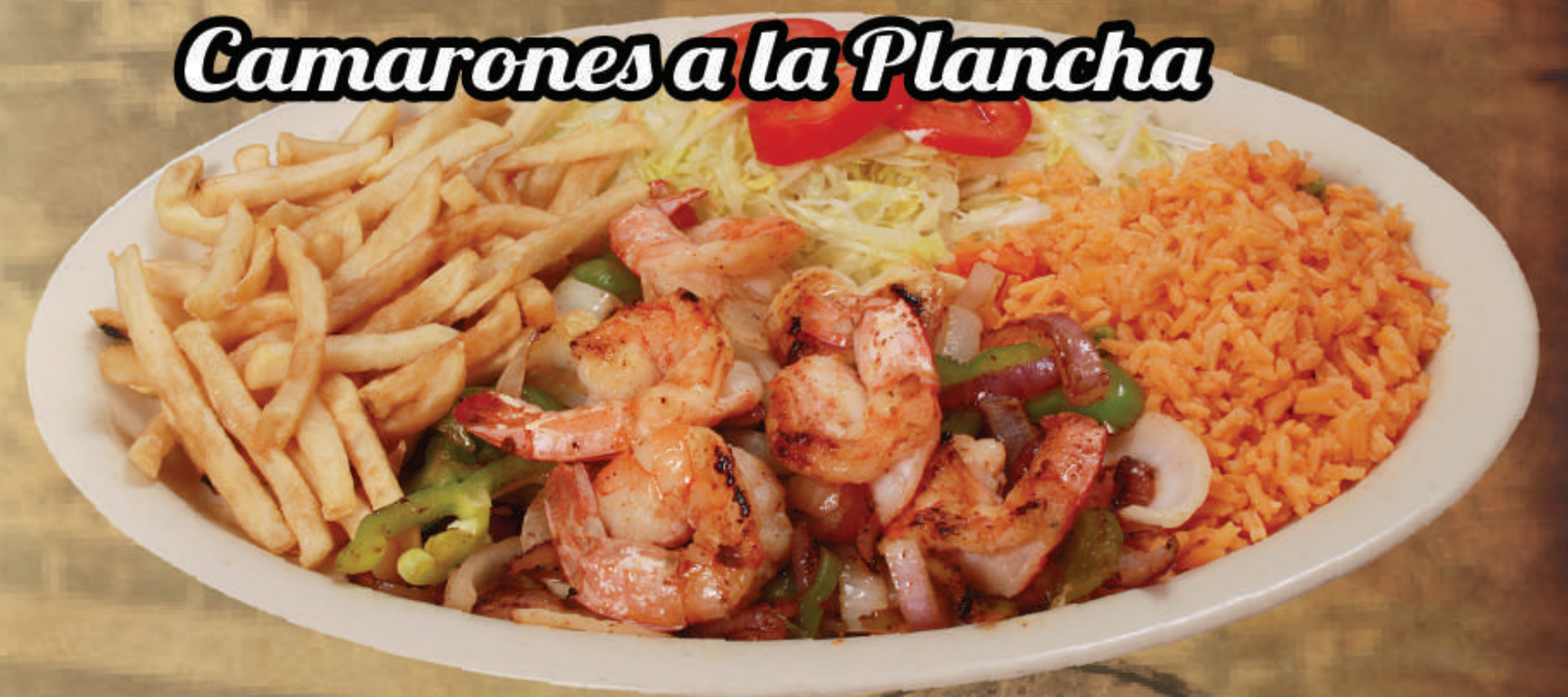
Camarones a la Plancha