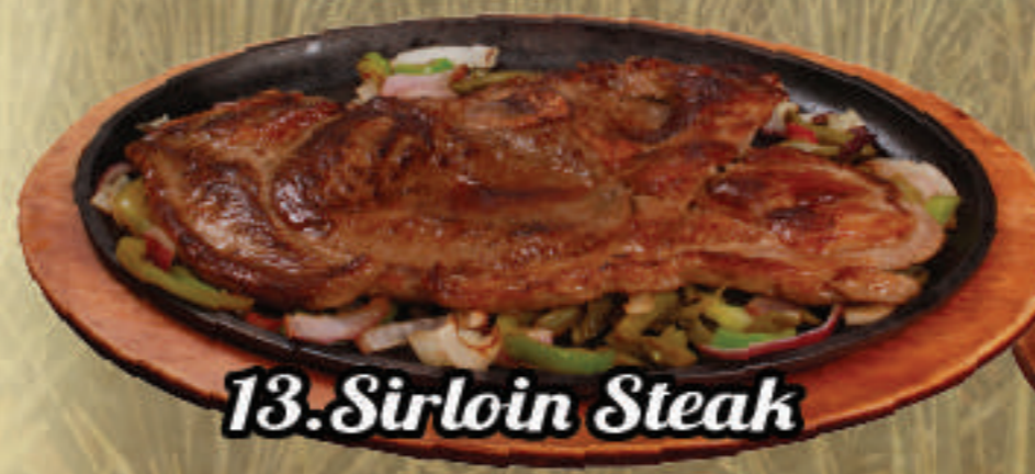
13. Sirloin Steak