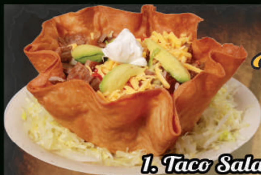
1. Taco Salad