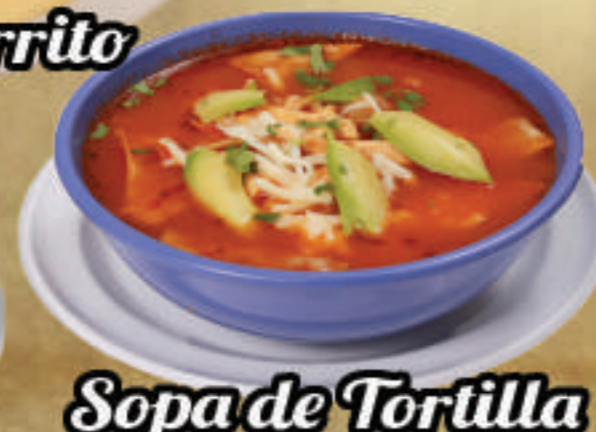
Sopa de Tortilla