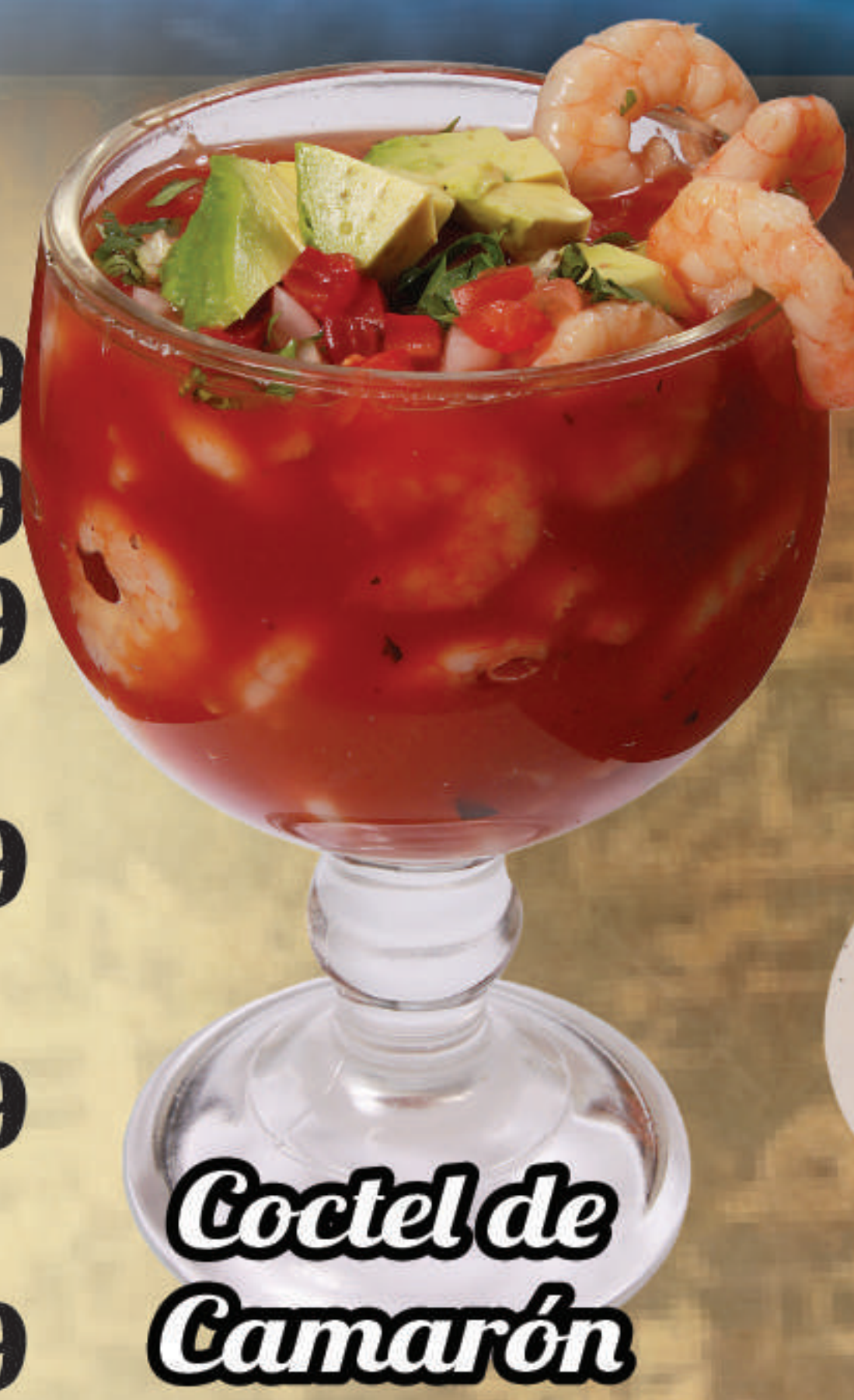
Coctel de Camarón