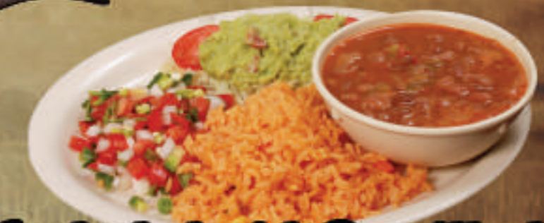
Included with Parrillada