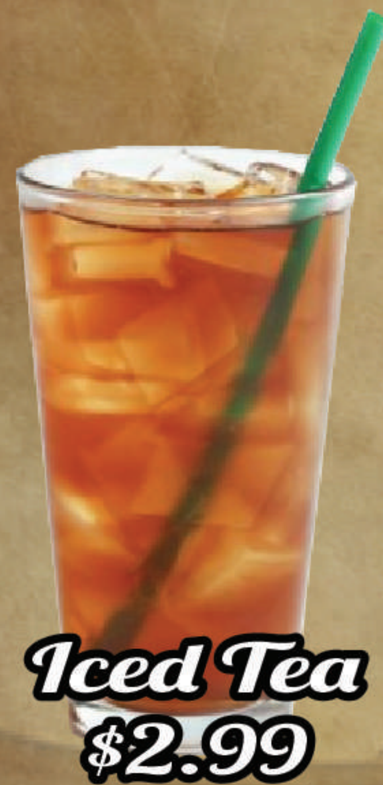
Iced Tea $2.99