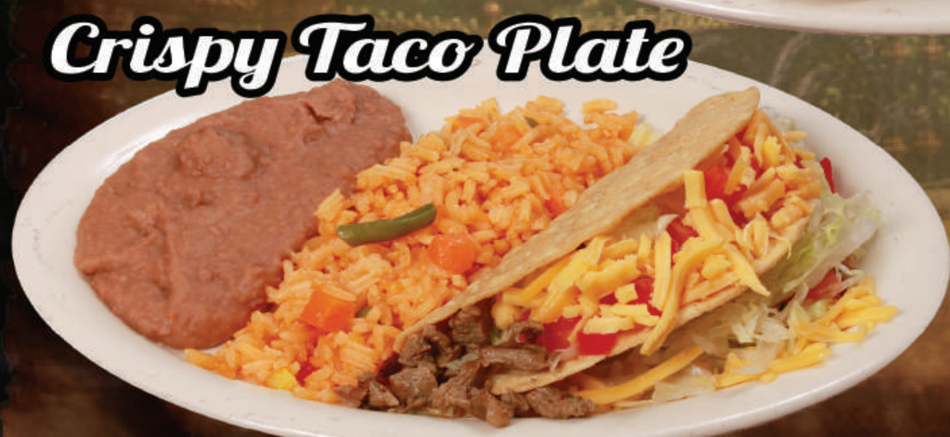
Crispy Taco Plate