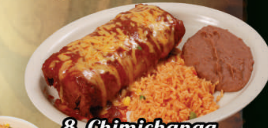
8. Chimichanga Soups