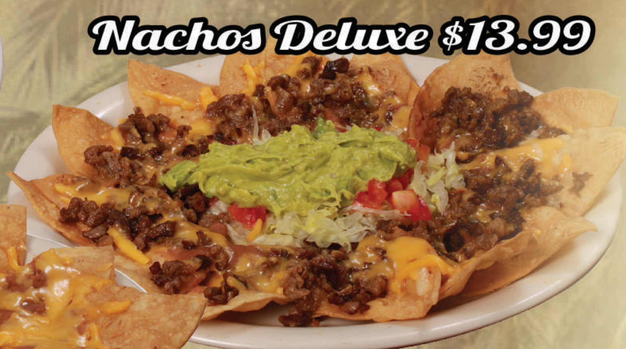
Nachos Deluxe $13.99