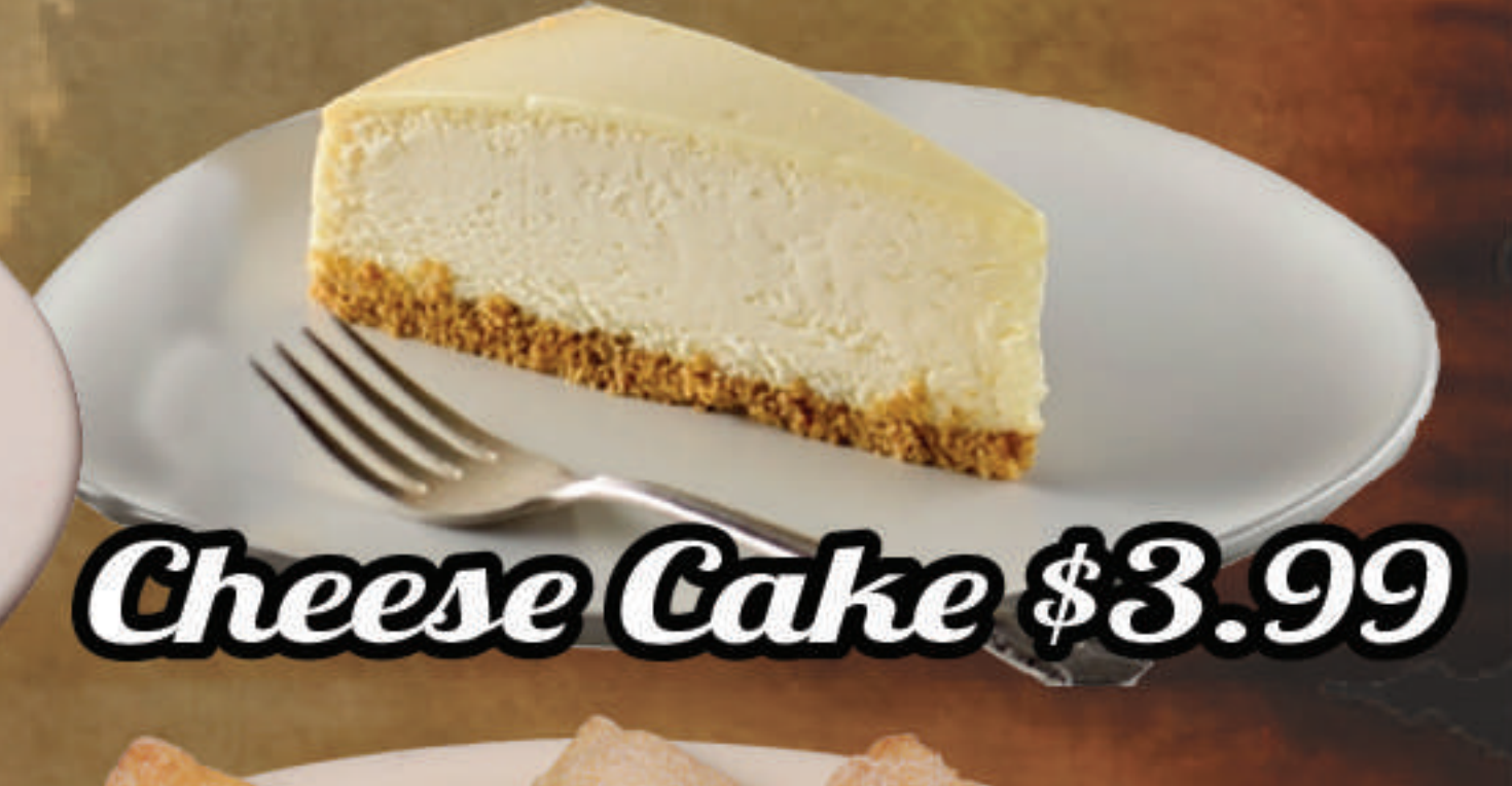
Cheese Cake $3.99