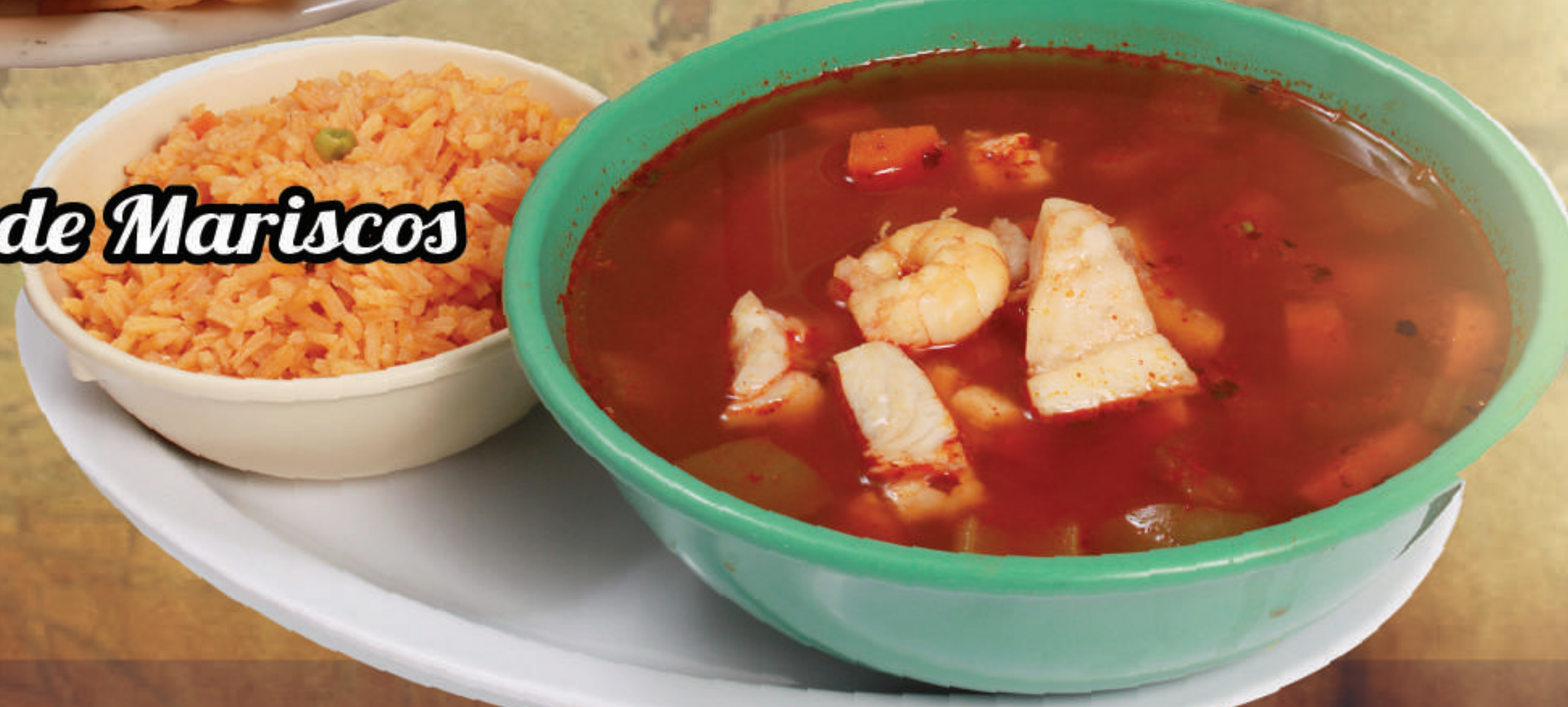
Caldo de Mariscos