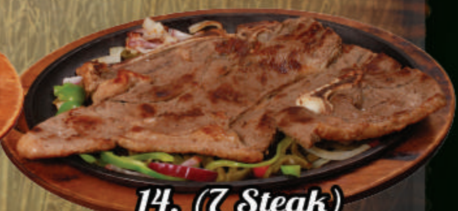
14. (7 Steak)