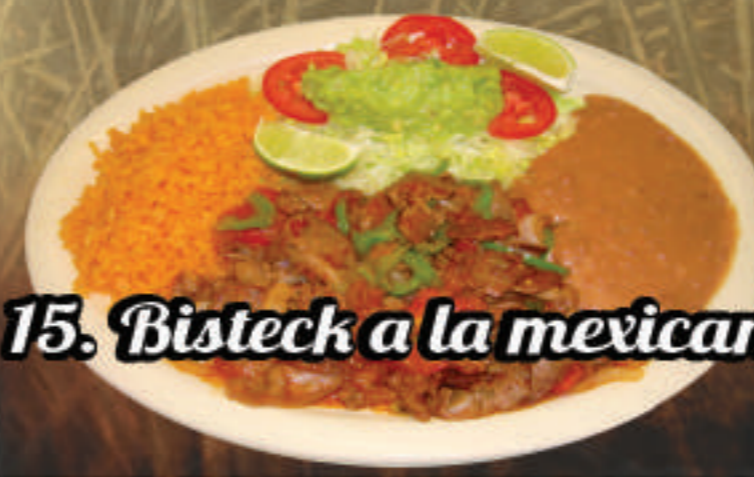
15. Bistek a la mexicana