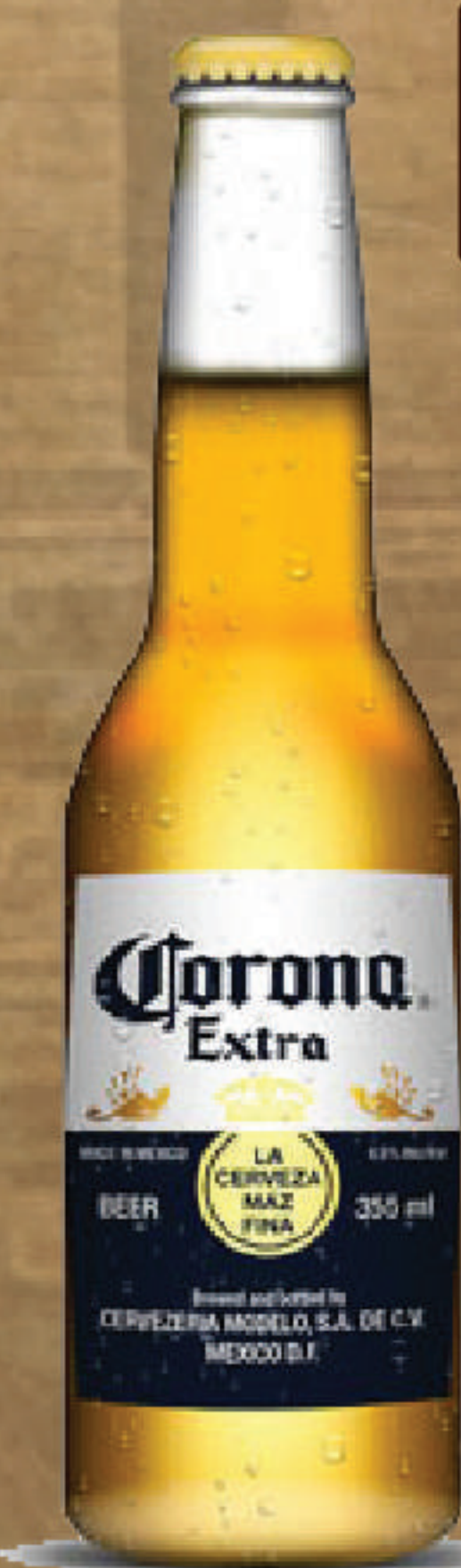
Domestic Beer $3.49 Imported Beer $3.99