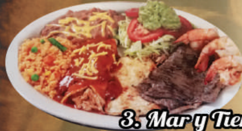
3. Mar y Tierra

Choice of Fajita, Chicken or Ground Beef (Does not include Beans and Rice)