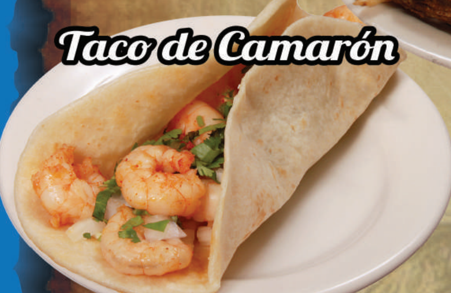
Taco de Camarón