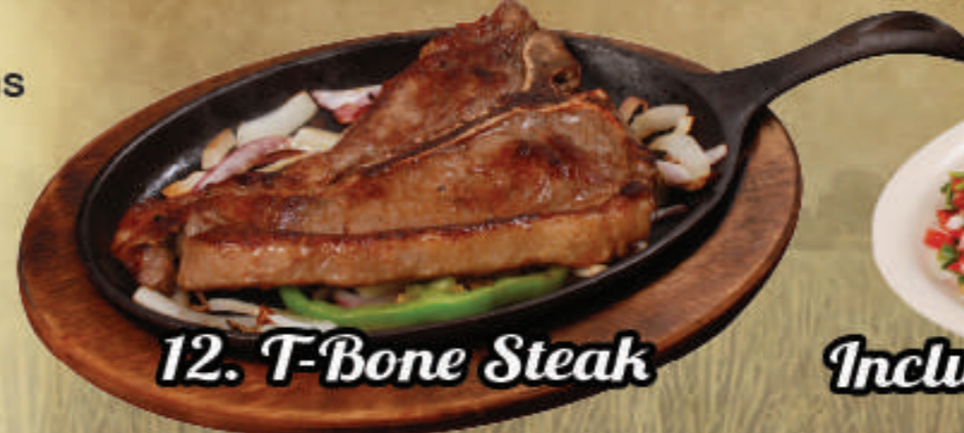
12. T-Bone Steak