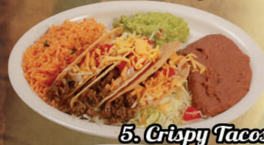
5. Crispy Tacos