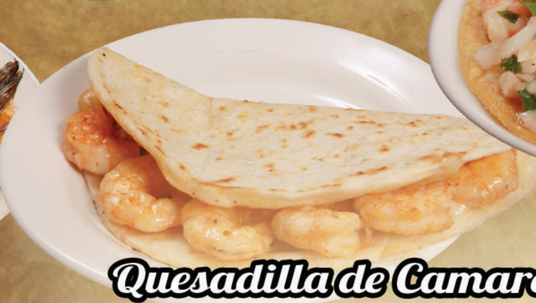
Quesadilla de Camarón