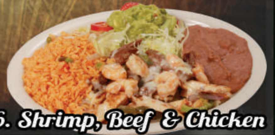
16. Shrimp, Beef & Chicken