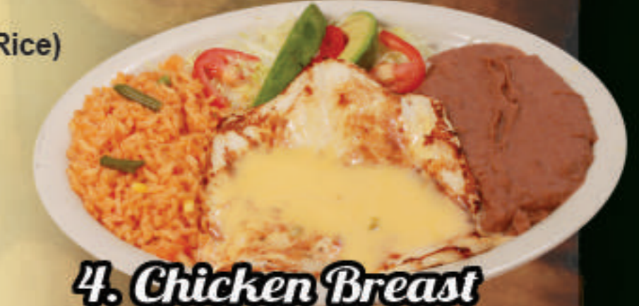
4. Chicken Breast