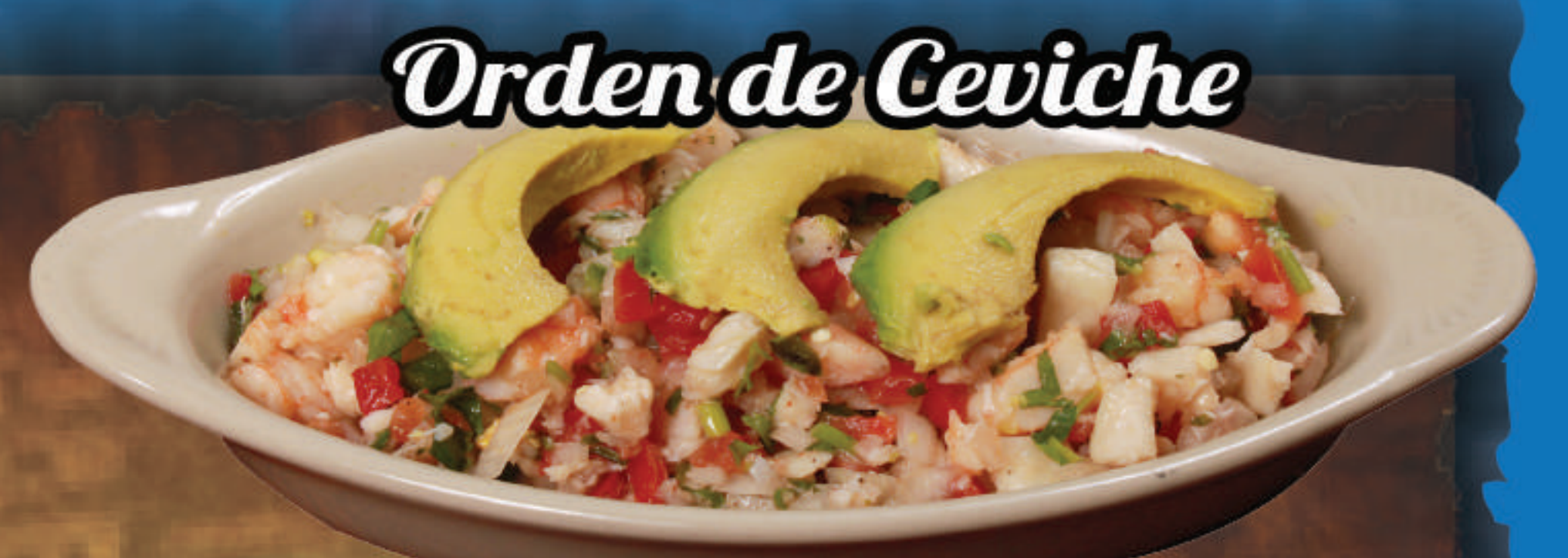
Orden de Ceviche