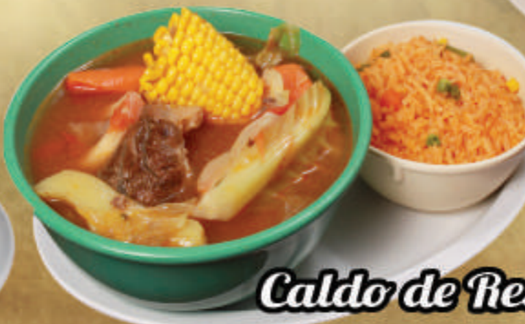
Caldo de Res