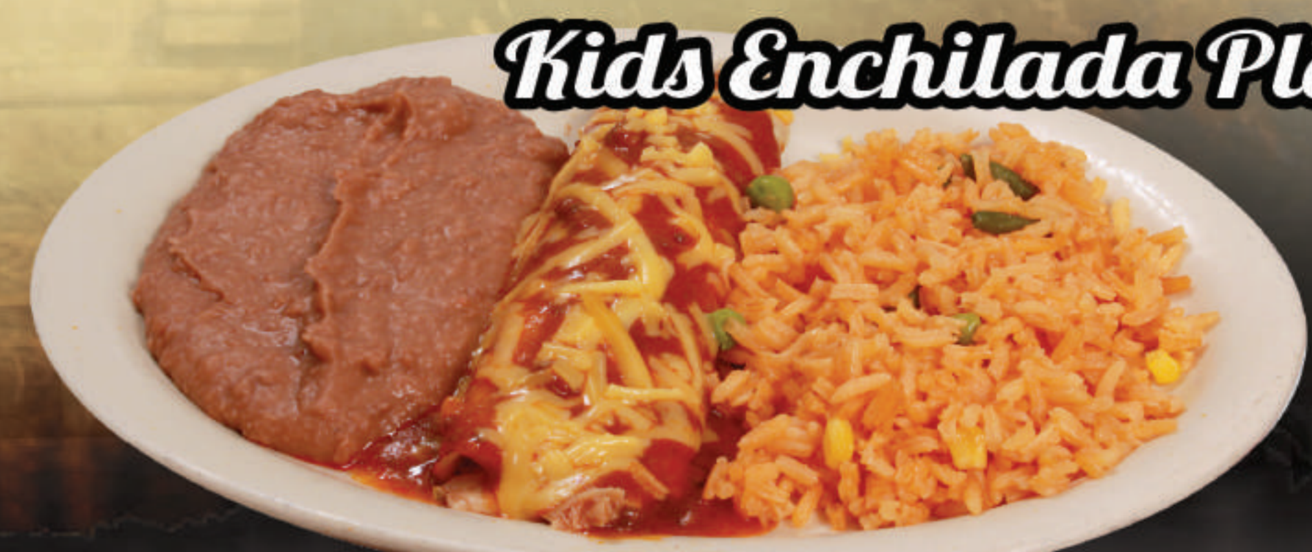
Kids Enchilada Plate