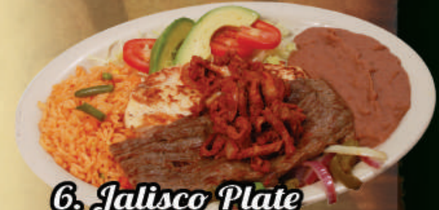
6. Jalisco Plate