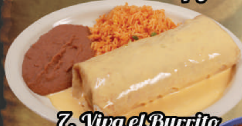
7. Viva el Burrito