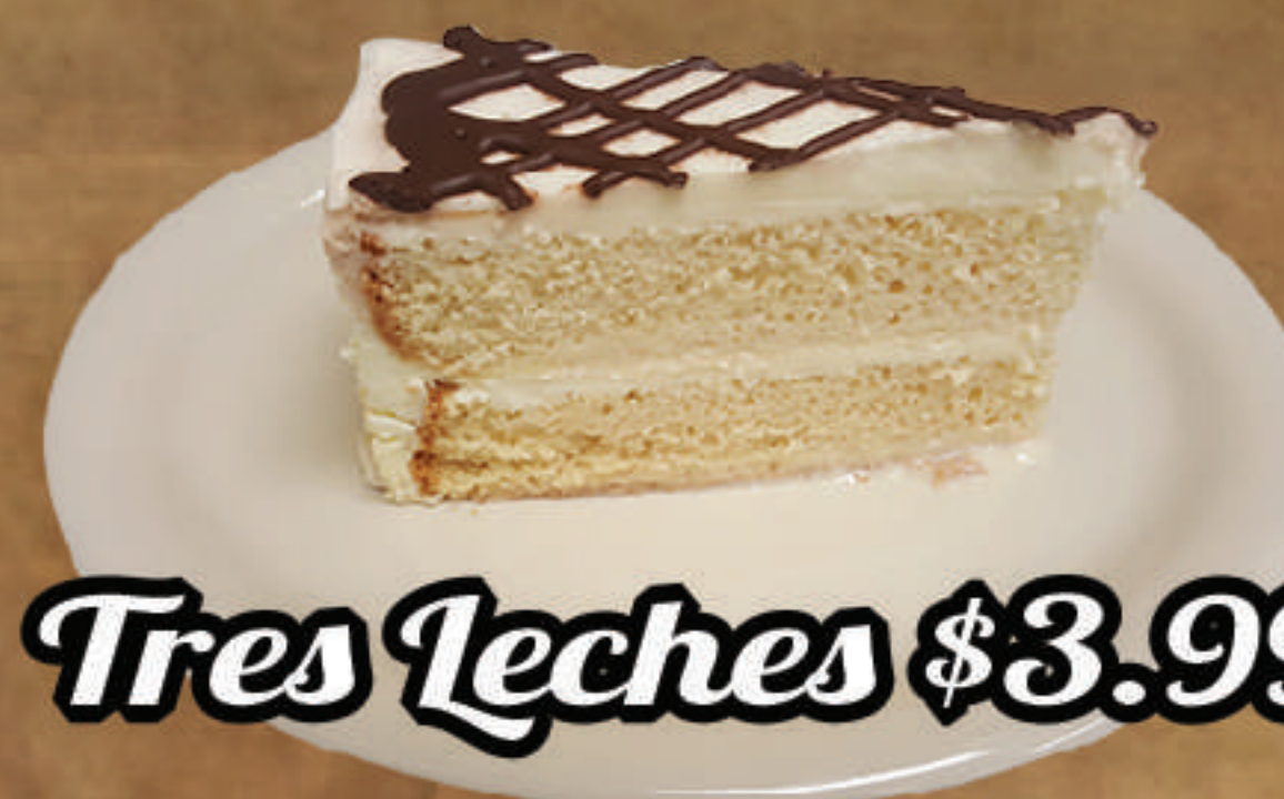
Tres Leches $3.99