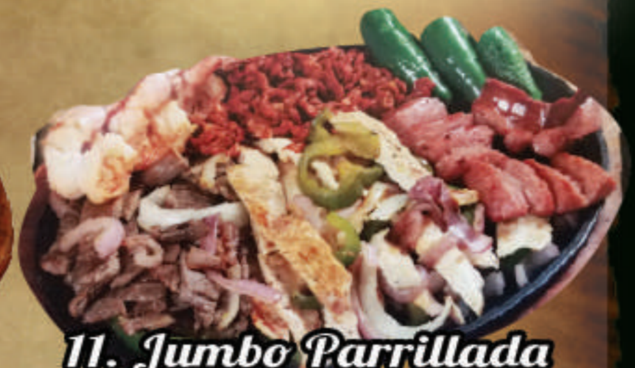
11. Jumbo Parrillada